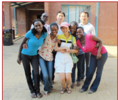
Center students in the University of Botswana