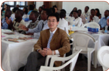
A Center student attending event in China Embassy in Zambia