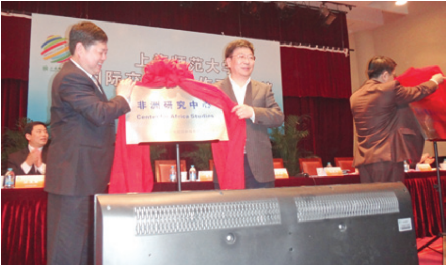
The leaders attending unveiling ceremony for the “ Region & Country Studies Base ”

The Center for African Studies of Shanghai Normal University was established in 1998, as an institution for African studies set up early in China.