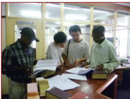
Center students in the Botswana National Archives