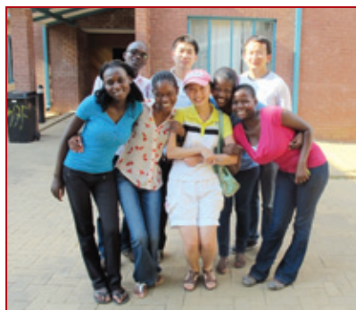
Center students in the University of Botswana