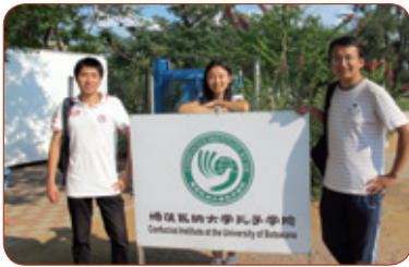
Center students in University of Botswana Confucius School