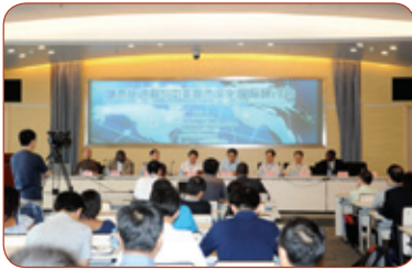
“Urbanization Process & China - Africa Urban Culture International Academic Conference ” held by the Center

At present, the Center has established exchange program with University of Botswana, Nairobi University, University of Zambia University, as well as numerous universities and research institutes in South Africa, Nigeria, Kenya, Zimbabwe, while keeping contact with African research scholars from the UK, France, the USA, etc.