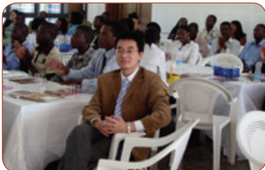
A Center student attending event in China Embassy in Zambia