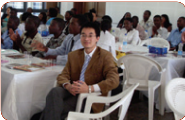
A Center student attending event in China Embassy in Zambia