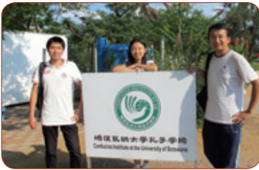
Center students in University of Botswana Confucius School