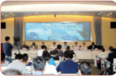
“Urbanization Process & China - Africa Urban Culture International Academic Conference ” held by the Center

At present, the Center has established exchange program with University of Botswana, Nairobi University, University of Zambia University, as well as numerous universities and research institutes in South Africa, Nigeria, Kenya, Zimbabwe, while keeping contact with African research scholars from the UK, France, the USA, etc.