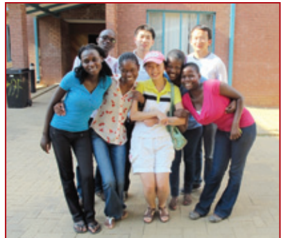
Center students in the University of Botswana